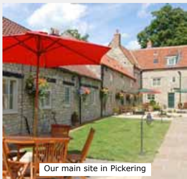
Our main site in Pickering

We are a small holiday cottage business with cottages in and around Pickering and on the North Yorkshire Moors. Our cottages are a mixture of those we own and operate ourselves and others that we act as an agency. The common link is that all the cottages have an emphasis on quality, service and a real home from home feel.