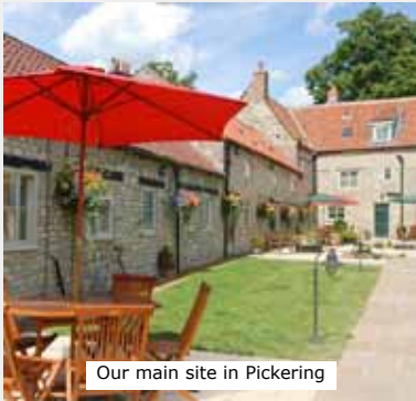
Our main site in Pickering

We are a small holiday cottage business with cottages in and around Pickering and on the North Yorkshire Moors. Our cottages are a mixture of those we own and operate ourselves and others that we act as an agency. The common link is that all the cottages have an emphasis on quality, service and a real home from home feel.