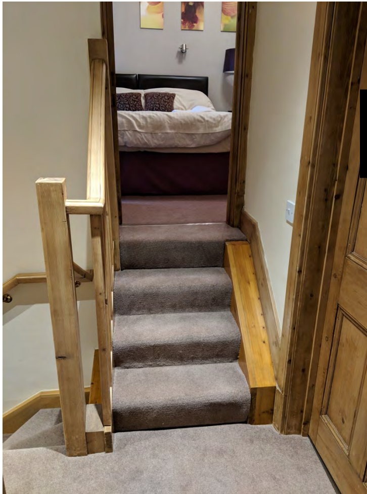
Stairs into bedroom 2 from the landing